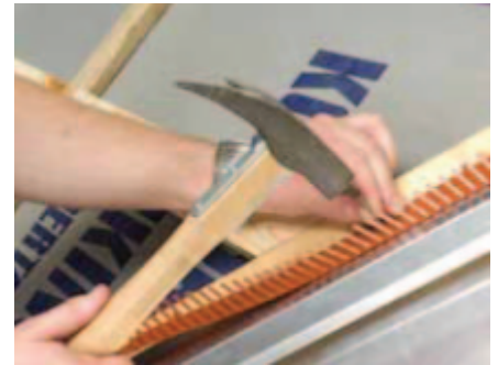
The eaves filler comb is fastened with none corrosive nails for each 25 cm.