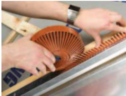
The Eaves filler comb is placed no more than 20 mm from the edge.